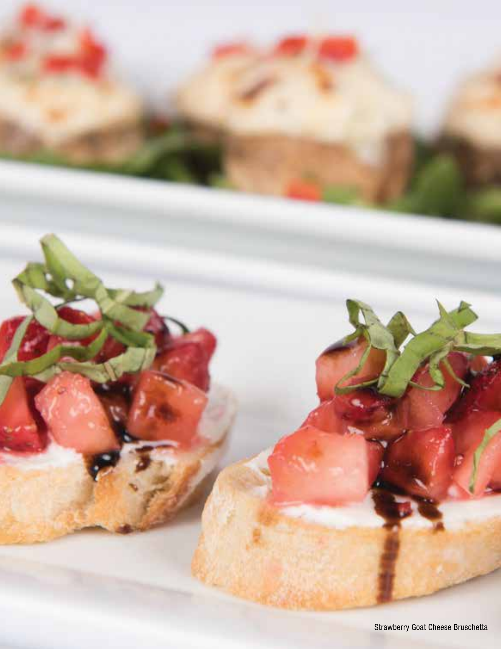
Strawberry Goat Cheese Bruschetta