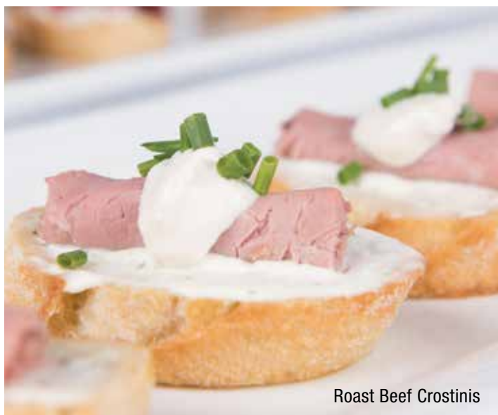
Roast Beef Crostinis