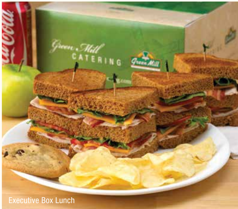
Executive Box Lunch