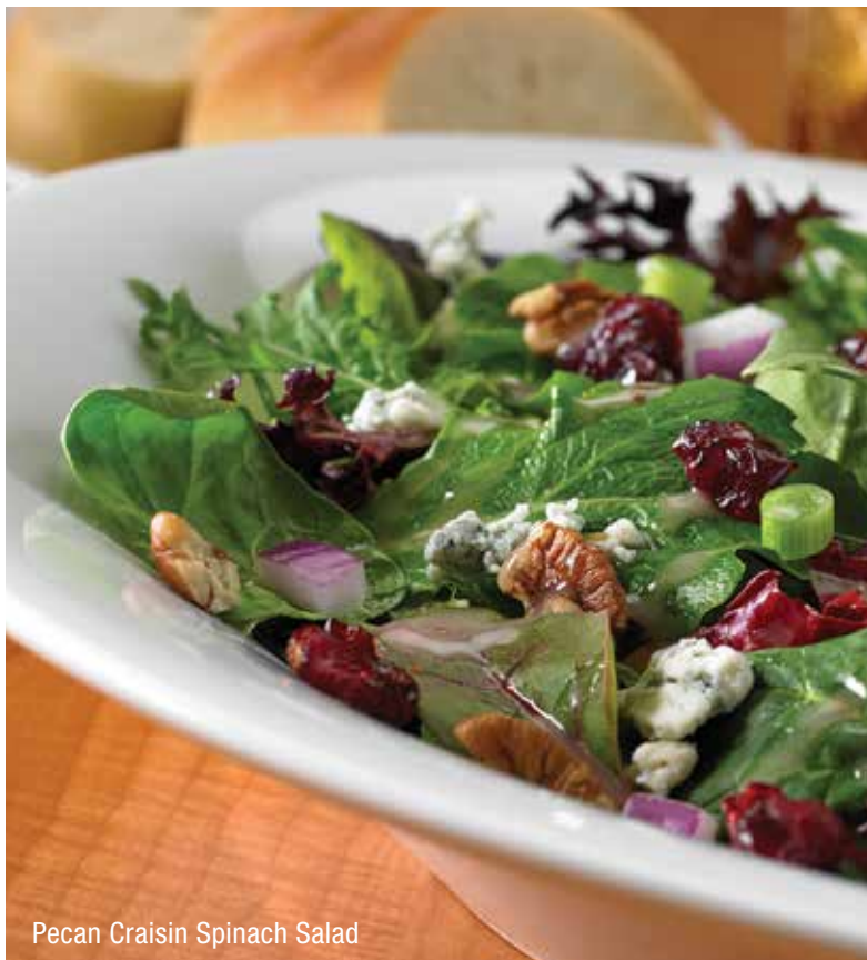
Pecan Craisin Spinach Salad