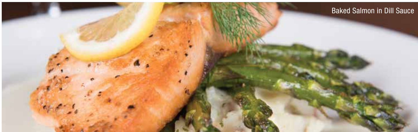
Baked Salmon in Dill Sauce