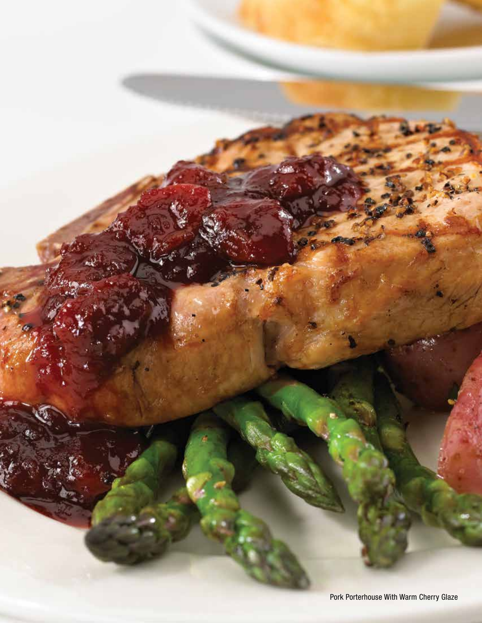
Pork Porterhouse With Warm Cherry Glaze