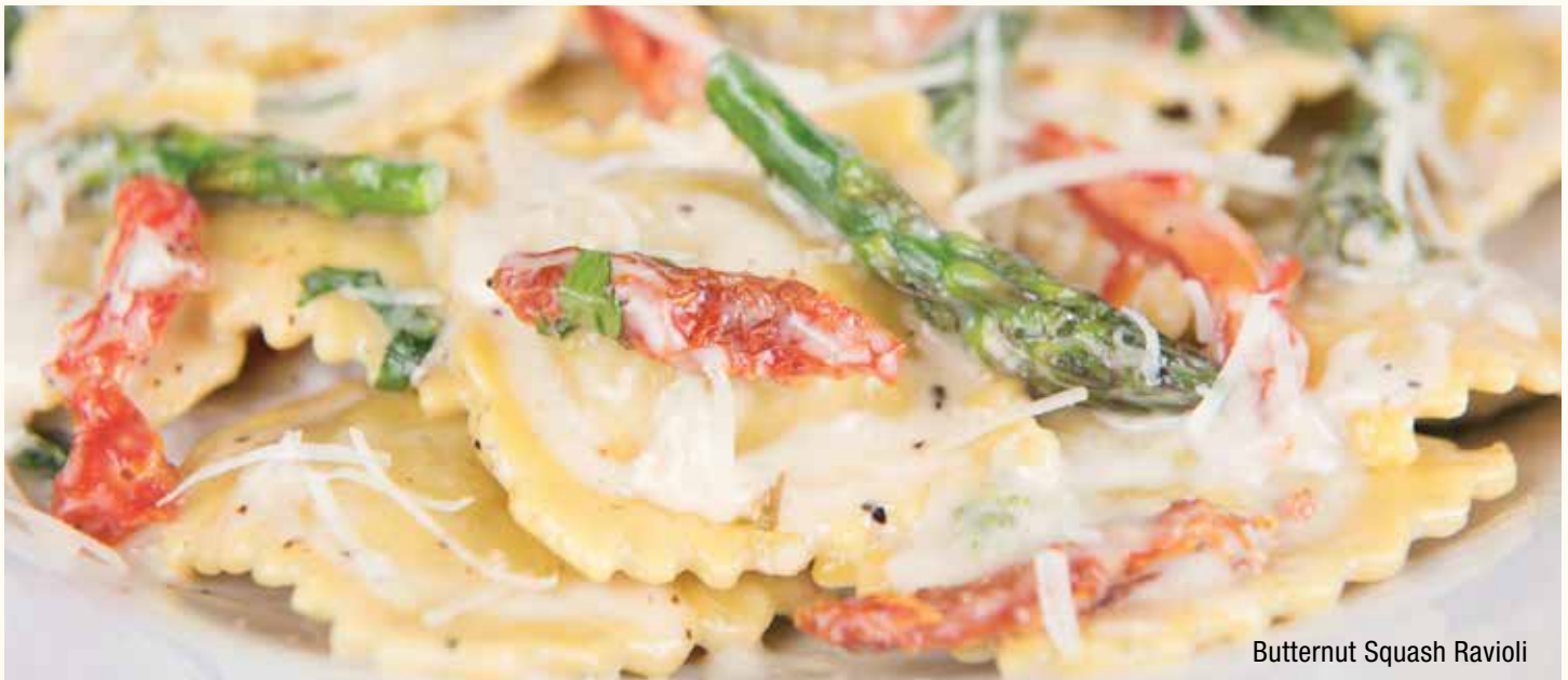
Butternut Squash Ravioli

☺ Denotes Gluten Friendly. Why do we call it Gluten Friendly? The indicated items are gluten free, but because we use high-gluten flour in our kitchen, there is a chance of cross-contamination on all items. We cannot guarantee that items are 100% gluten free.