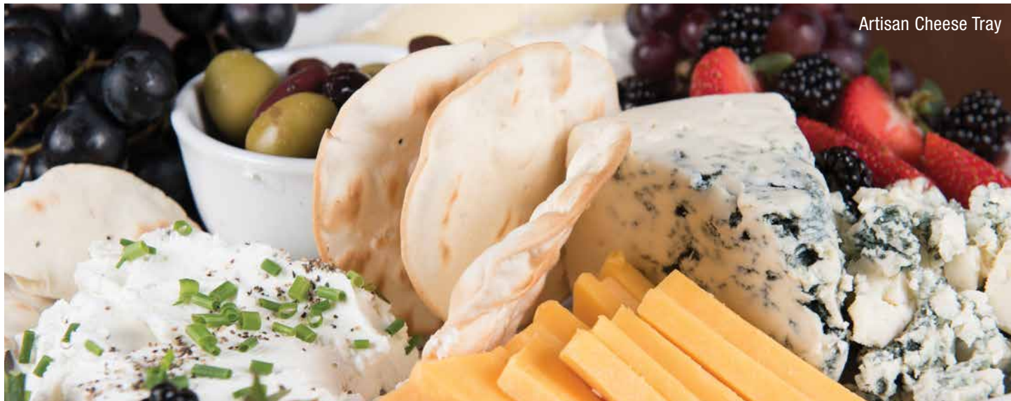
Artisan Cheese Tray