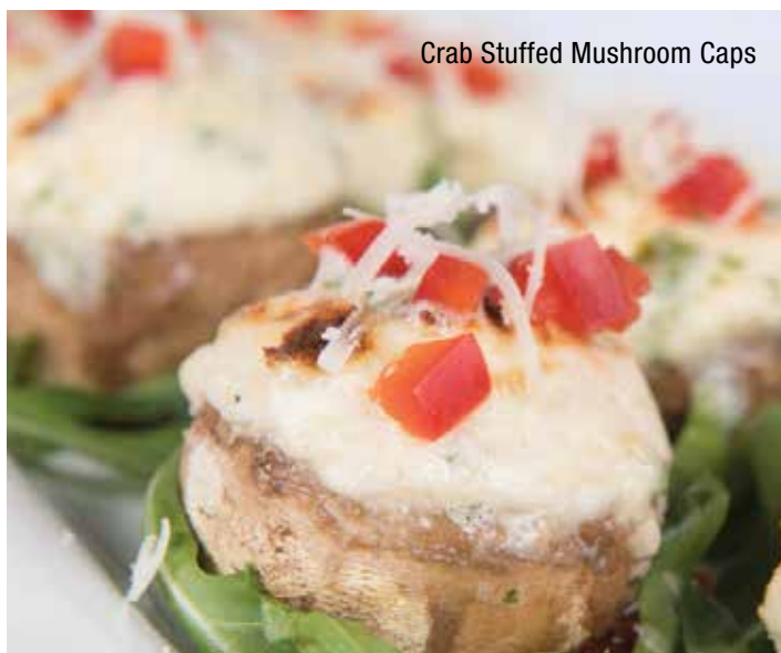
Crab Stuffed Mushroom Caps