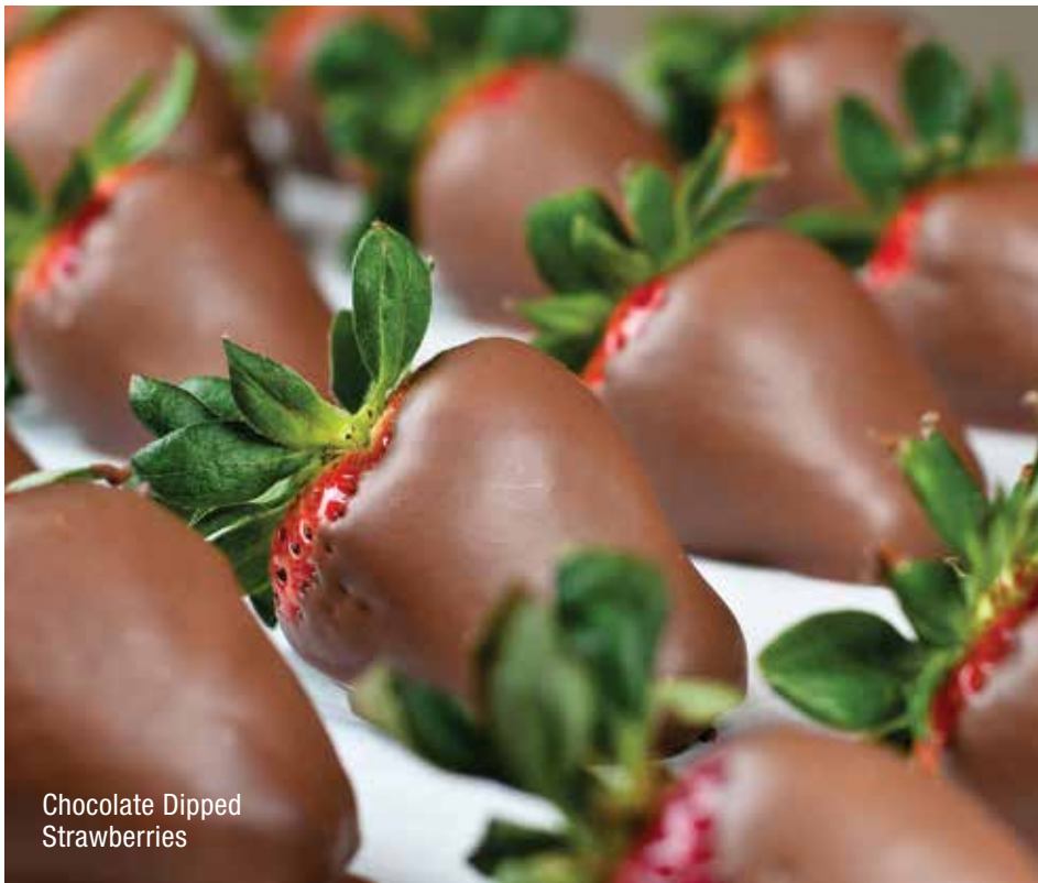
Chocolate Dipped Strawberries