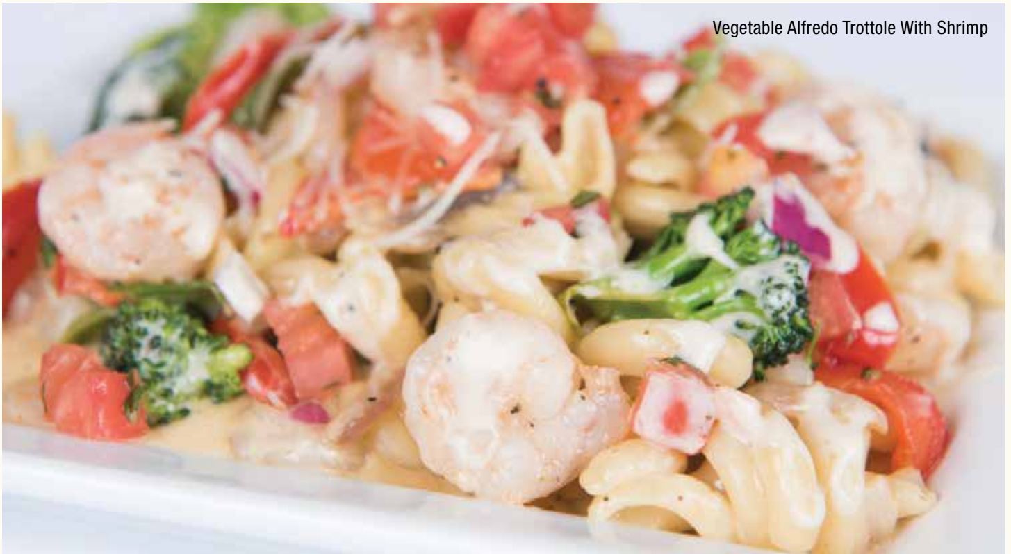
Vegetable Alfredo Trottole With Shrimp

Minimums may apply. Combination meals available for additional cost. Contact your Green Mill sales associate for custom menu information.